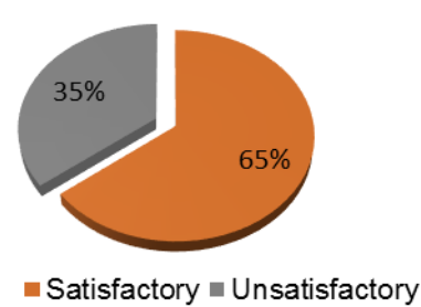
Figure-1: Frequency distributions of satisfactory and unsatisfactory drinking water samples (n= 462).

All of 40 bottled water samples were found satisfactory for drinking purpose.